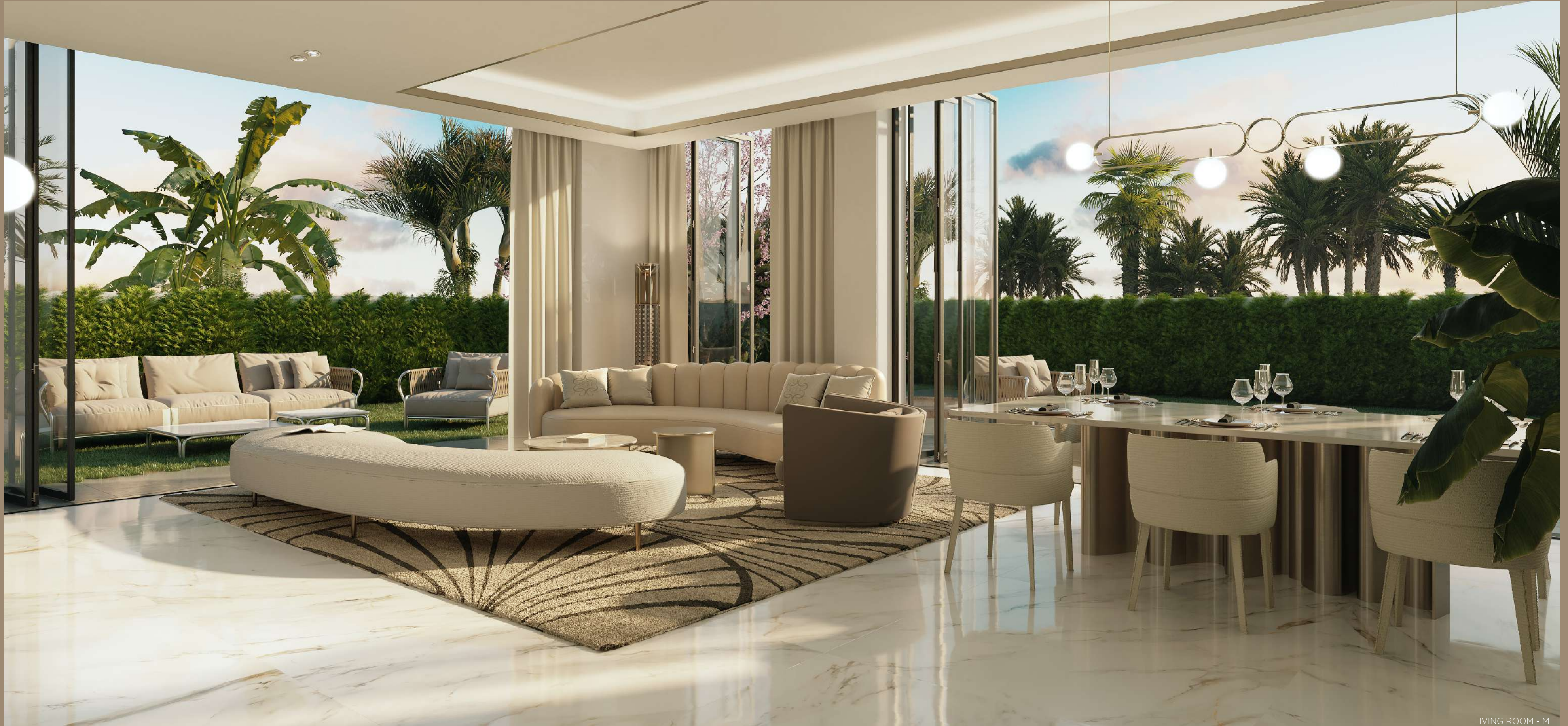
LIVING ROOM - M