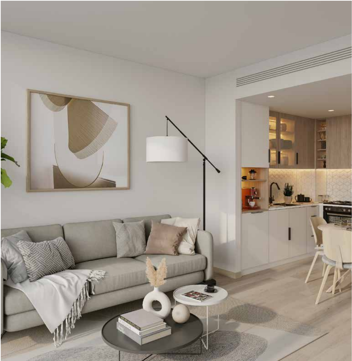
1 BEDROOM - LIVING ROOM

1. All room dimensions are in metric and measured to structural elements and exclude wall finishes and construction tolerances. 2. All dimensions have been provided by our consultant architects. 3. All materials, dimensions, drawings features and amenities are approximate at the time of printing. 4. Actual area may vary from stated area and unit direction may vary from unit to unit. Drawings not to scale E&EO. The developer reserves the right to make revisions to the floor plans and any features, materials, dimensions, drawings and amenities mentioned in this brochure without notice.