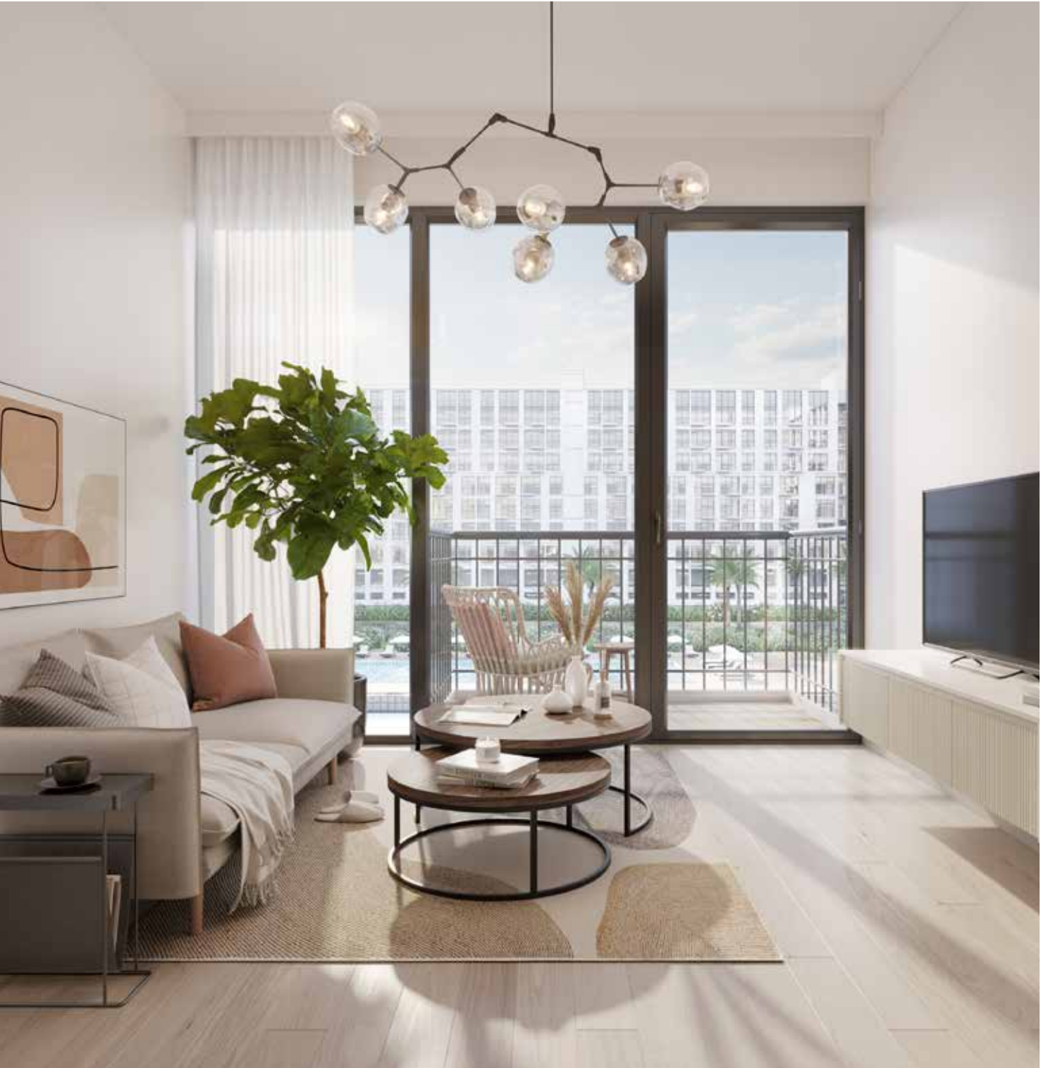
STUDIO LIVING ROOM

1. All room dimensions are in metric and measured to structural elements and exclude wall finishes and construction tolerances. 2. All dimensions have been provided by our consultant architects. 3. All materials, dimensions, drawings features and amenities are approximate at the time of printing. 4. Actual area may vary from stated area and unit direction may vary from unit to unit. Drawings not to scale E&EO. The developer reserves the right to make revisions to the floor plans and any features, materials, dimensions, drawings and amenities mentioned in this brochure without notice.