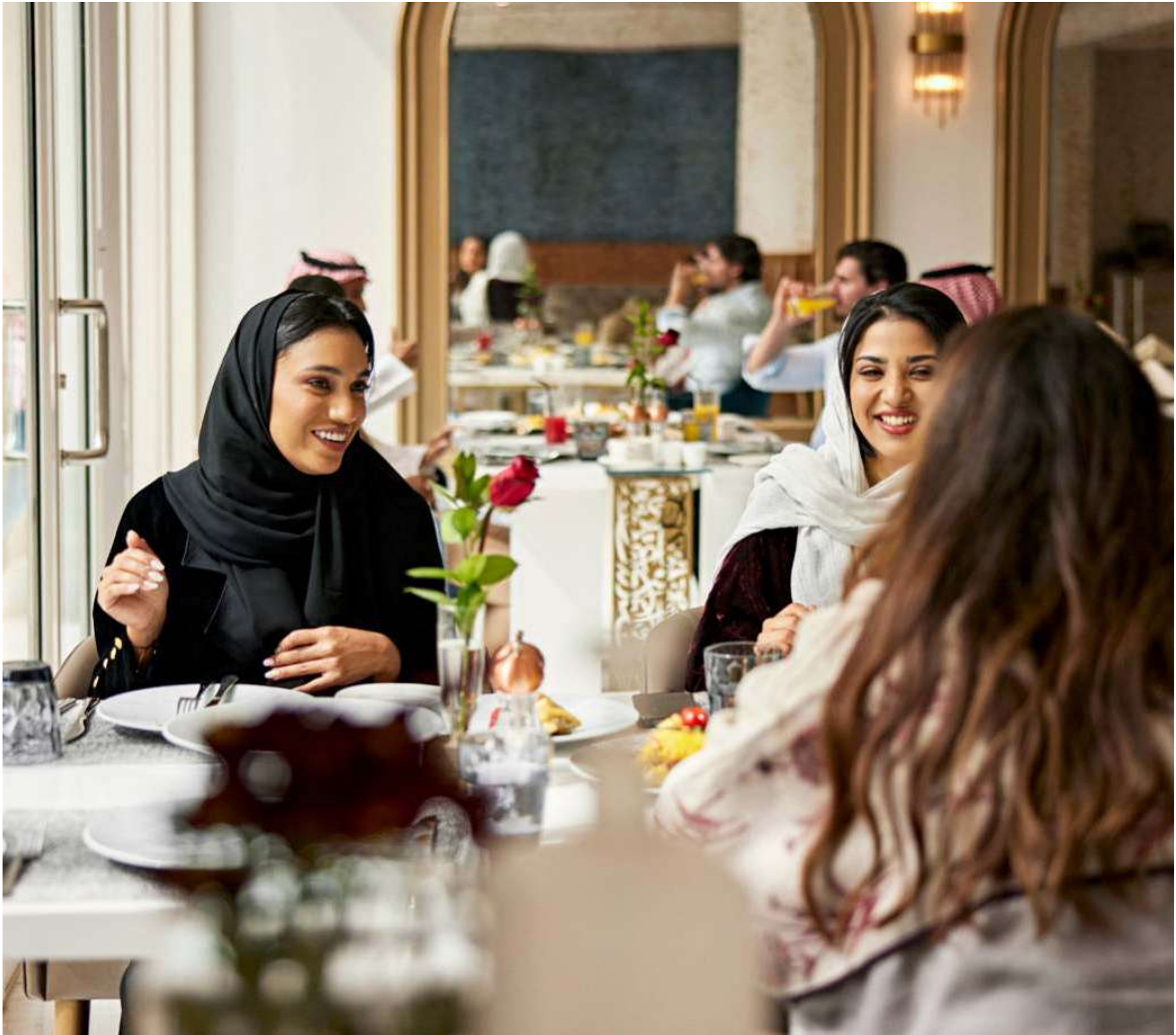
Retail & Dining