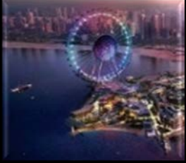
The Blue Waters