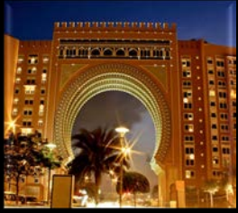
Ibn Battuta Mall