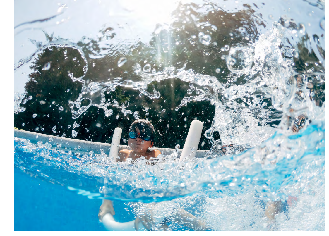
IN THE PLACE YOU WANT